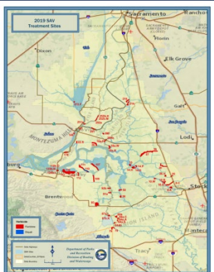
<u>2019 SAV Treatment</u> <u>Sites Map</u>

Click <u>here</u> for map with Diquat treatment included.